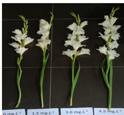
Figure 2. Gladiolus flower appearance due to the application of TA compound.

This experiment following image shows the Gladiolus flower due to the application of TA organic compounds at some concentration level on Figure 2.